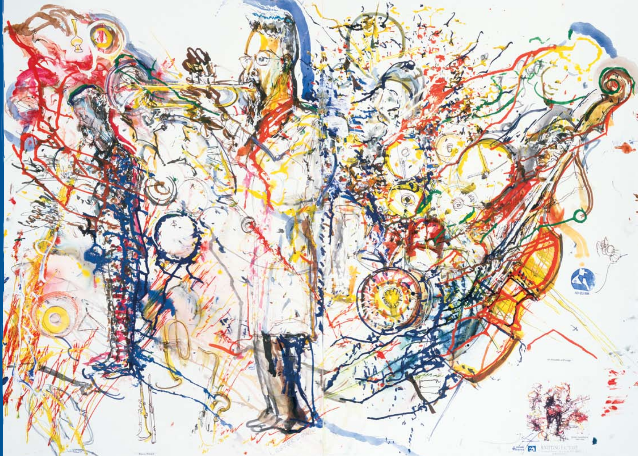
Art Ensemble © Jeff Schlanger, musicWitness®